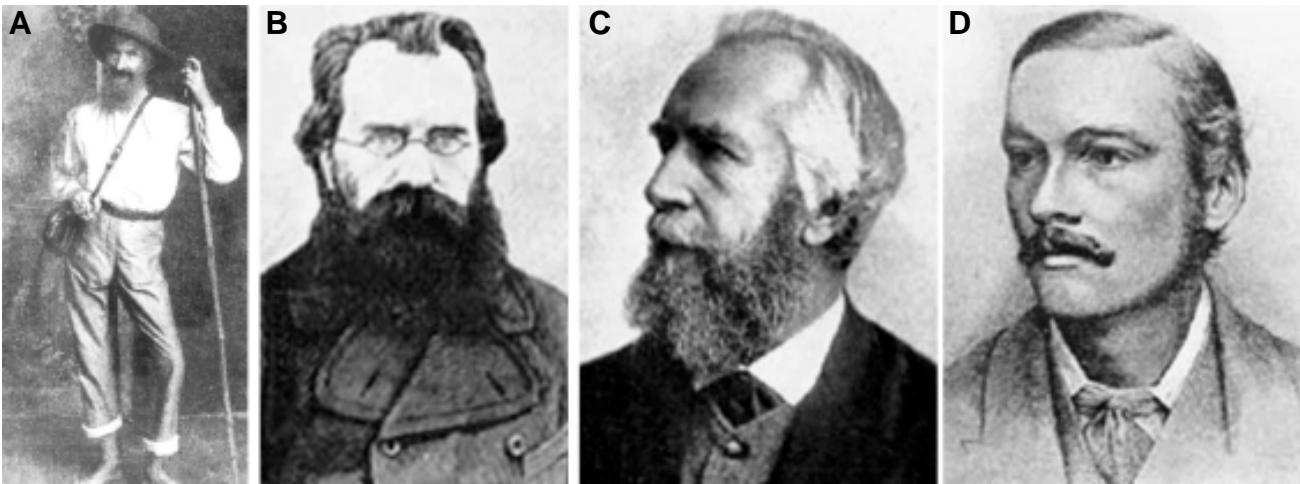
Fig. 1. Relating embryology and evolution immediately after Darwin. Four of the founders of evolutionary embryology. (A) Fritz Müller, known primarily for his studies of mutualism and mimicry among unpalatable insects, shown here in collecting attire. An outstanding naturalist, he used crustaceans to link natural selection and embryology. (B) Alexander Kowalevsky used embryonic homologies to link the invertebrates and vertebrates. (C) Ernst Haeckel believed development to be the motor of evolution, and he fought battles with Kowalevsky over the meaning of gastrulation (while using Kowalevsky's figures). (D) Francis M. Balfour used larvae in critical ways to deduce phylogeny. His work was cut short when he died at age 31 while climbing the Mont Blanc.